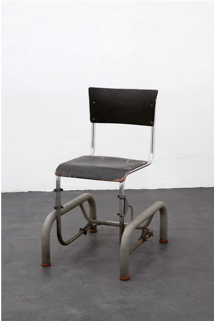
Stuhl 9H - 2010 - 90 x 51 x 62 cm - Mart Stam chair, steel, lacquer, wood.