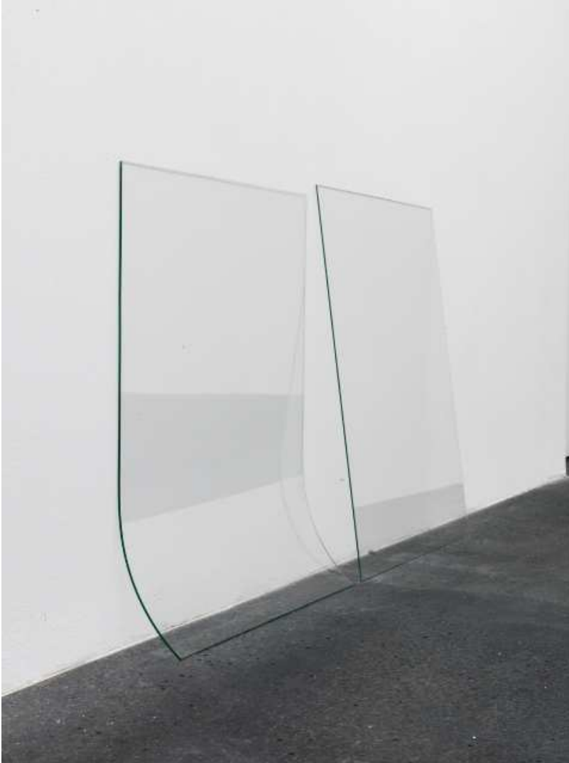
Untitled - 2011 - 70 x 140 x 15 cm – glass.