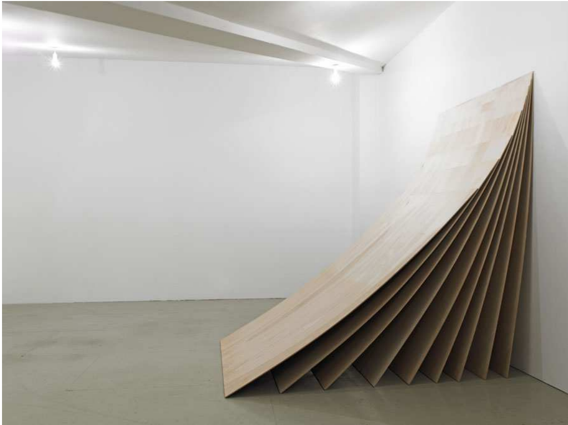
La Jalousie - 2010 – 250 x 125 cm – wood.